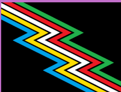
The original disability pride flag from 2019

There is even a disability pride flag to represent our community with honor.